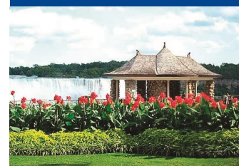
Visit beautiful Queen Victoria Park

Departure: The Bank of Missouri, 400 S. Muldrow, Mexico, MO @ 8 am