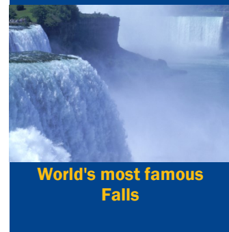
World's most famous Falls