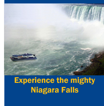
Experience the mighty Niagara Falls