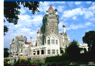
Magnificent Casa Loma Castle in Toronto