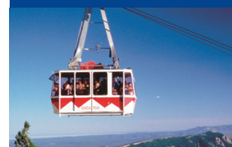
Breathtaking Views of the Sandia Mountains