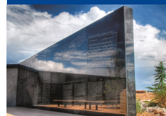
New Mexico Veterans' Memorial