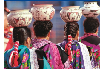
Native Southwestern Culture and Crafts