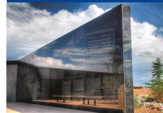
New Mexico Veterans' Memorial