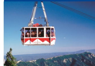
Breathtaking Views of the Sandia Mountains