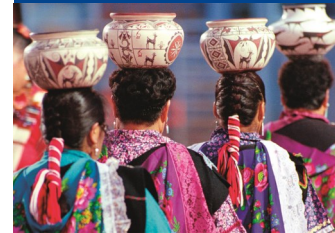
Native Southwestern Culture and Crafts